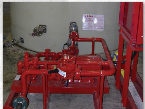
Balanced Pressure Pump Concentrate Control System