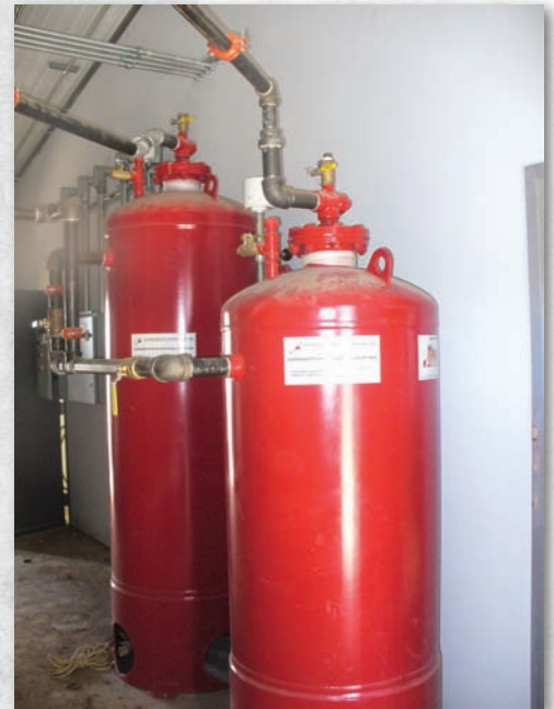
Bladder Tank Concentrate Control System

Custom configurations available upon request